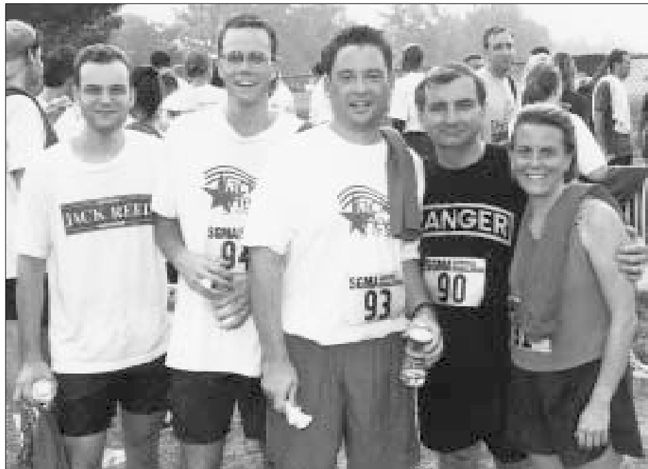
Reed's Ranger's Senator Jack Reed (D-RI), #90