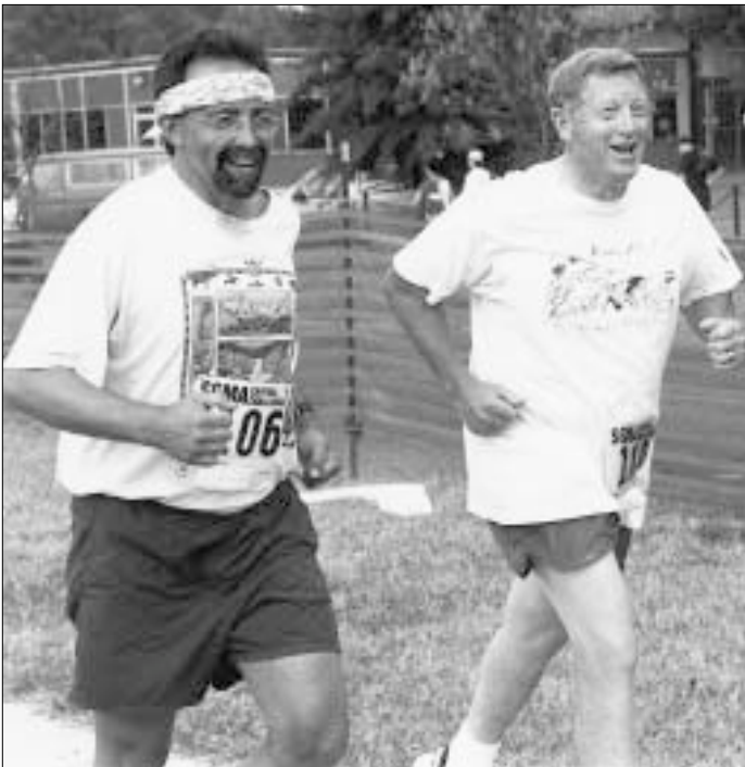
Senator Conrad Burns (R-MT), #110