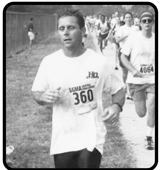
Rep. Steve Largent (R-OK)