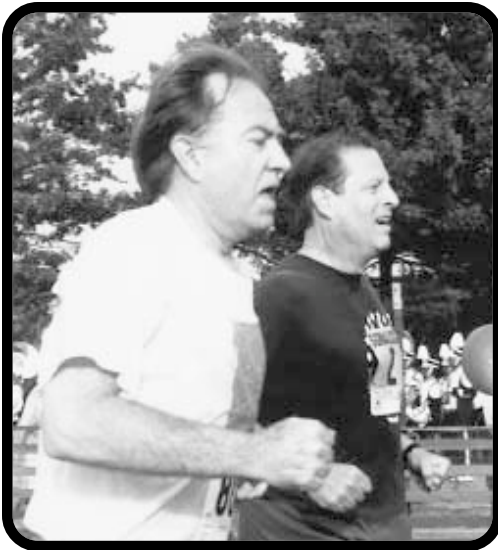
Vice President Al Gore