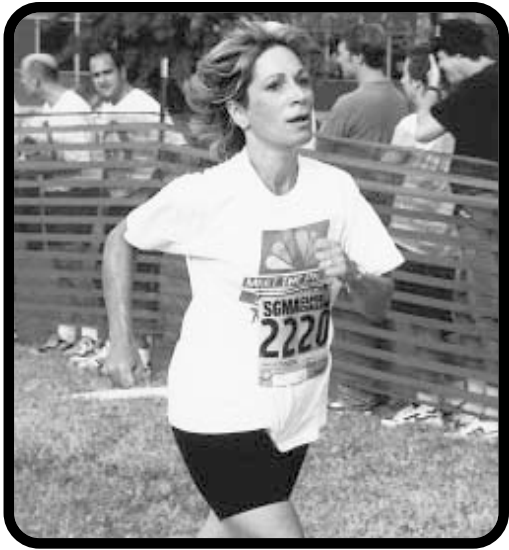
NBC's Andrea Mitchell