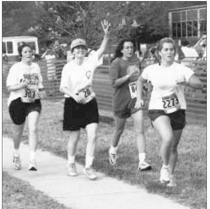
Senator Kay Bailey Hutchison (R-TX), #20 happily heads for finish as 1 st female Senator.