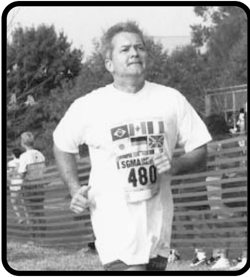
Rep. Mark Foley (R-FL)