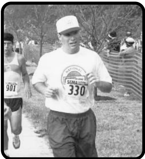
Rep. Tim Holden (D-PA)