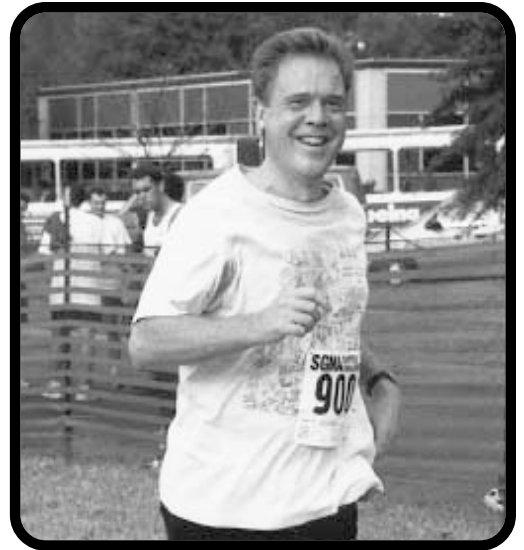
Q. Todd Dickinson, Deputy Comm. Patent and Trademark Office