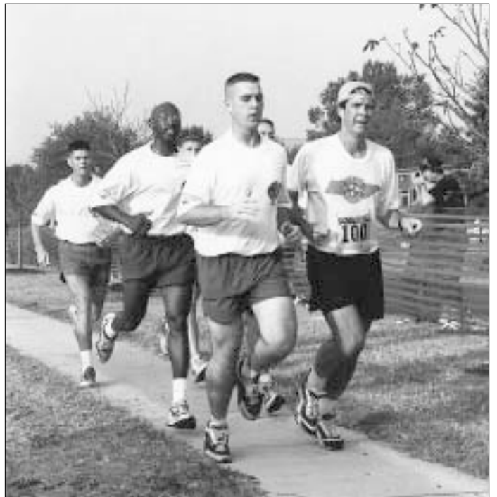
Senator Bill Frist (R-TN)