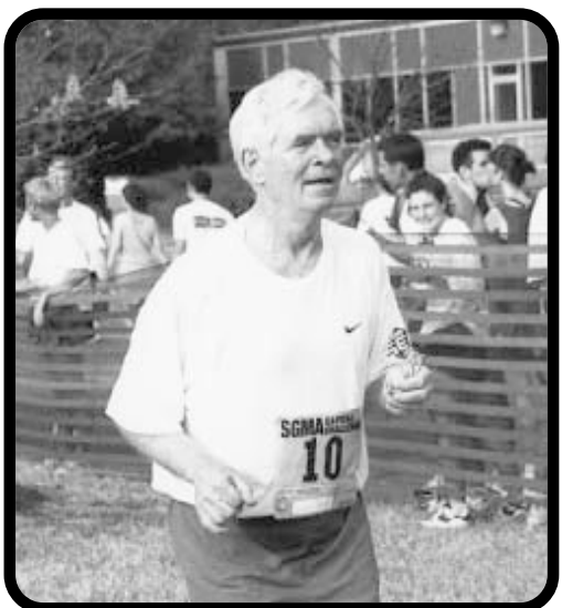
Senator Thad Cochran (R-MS)