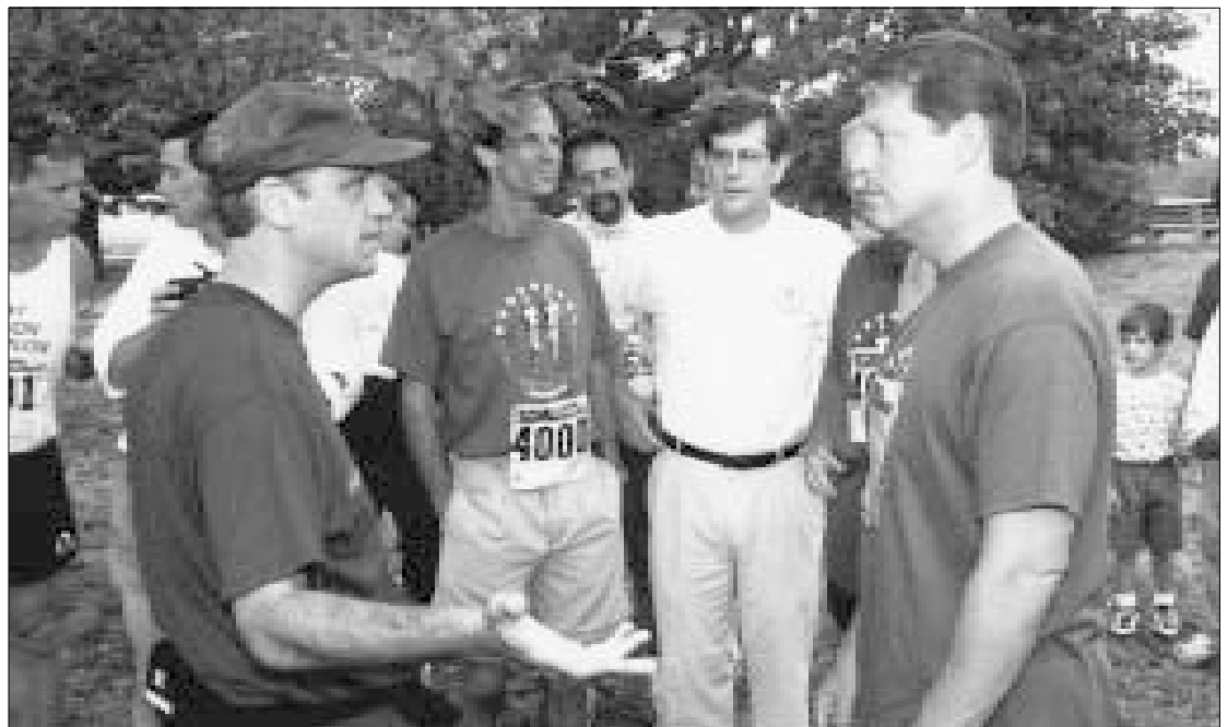
"My training is increasing but my times won't come down!" Rep. Blumenauer seeks counsel from Vice President Gore.