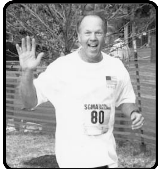
Senate Majority Whip, Don Nickles (R-OK), first Senator