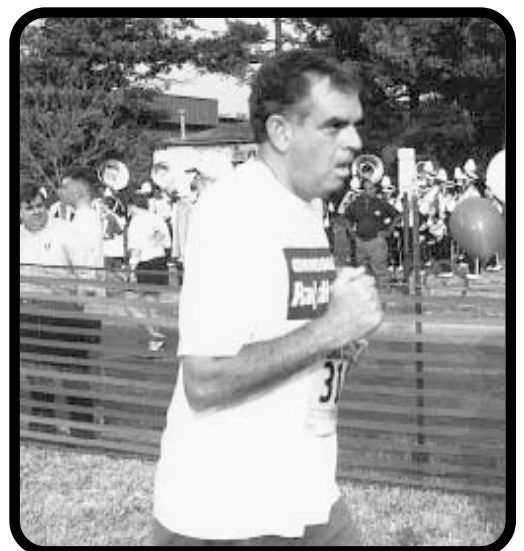
Rep. Ray LaHood (R-IL)