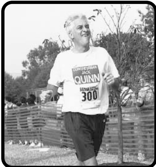
Rep. Jack Quinn (R-NY) heads for the finish.