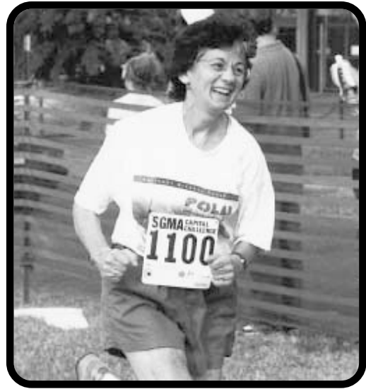
Rita Colwell, National Science Foundation Director and 1 st Independent Agency Head (Female)